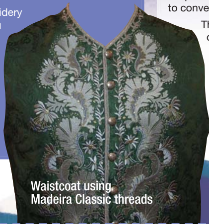
Waistcoat using Madeira Classic threads