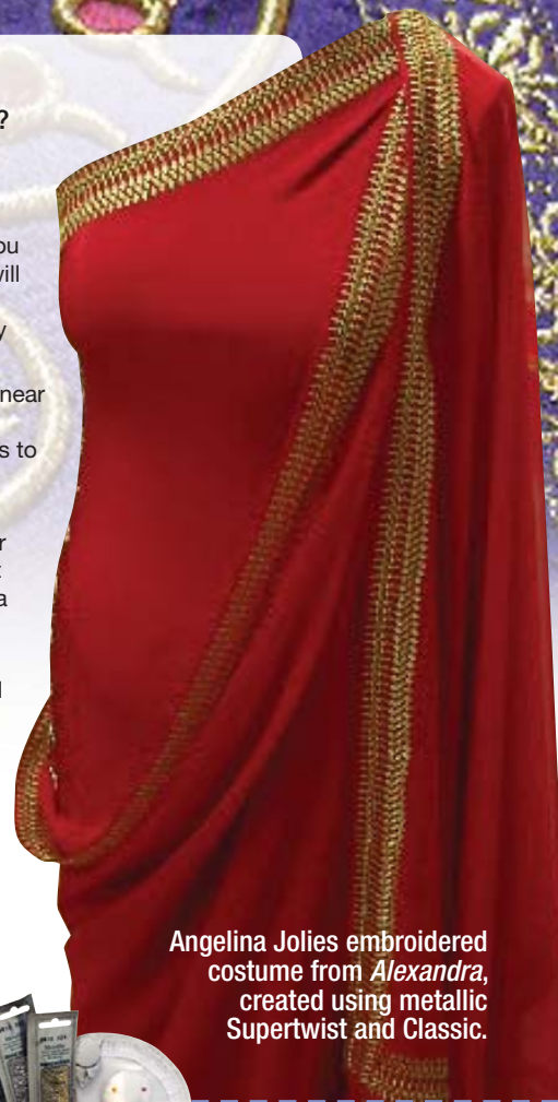
Angelina Jolie's embroidered costume from Alexandra , created using metallic Supertwist and Classic.

The metric system is essentially the opposite of these two methods, and most embroidery and sewing threads adhere to this unit of measurement. All you really need to remember is that the higher the number, the finer the thread and the lower the number the thicker the thread. So on Madeira reels, a number 12 thread will be thicker than a number 40.