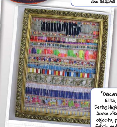
"Discarded" Eilish, 17 Derby High School Woven discarded objects, plastic, fabric and string