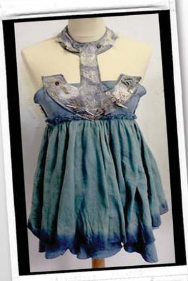
"Anchor Dress" Isabel, 15 Wymondham College Dip-dyed calico and cotton with mixed buttons and threads