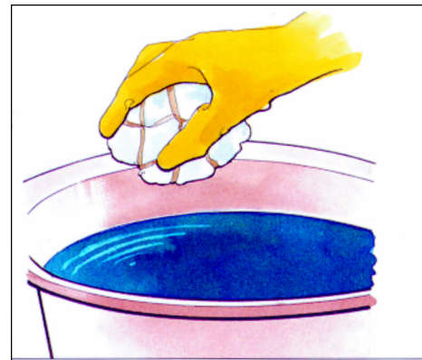
Crumple the fabric up into a ball, tie it with elastic bands and put it in the dye bath for 30 minutes.