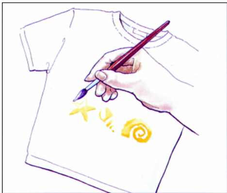
Paint Easy Batik onto the fabric - you could use a stencil...or you could block print with Easy Batik.

Easy Batik is an easy way to make a 'Batik' design without having to use hot wax.