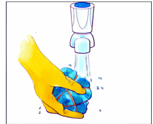
Take the fabric out of the dye, rinse it well and then untie it...

Batik is known as a RESIST technique, because the waxed areas RESIST the dye.