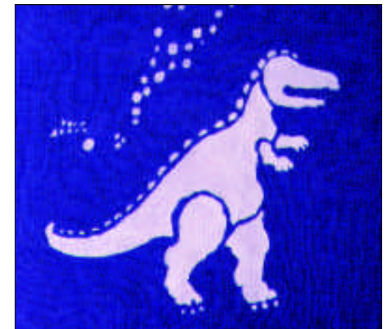
Fabric flat dyed after application of Easy Batik